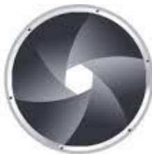
Small Aperture f/22