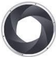
Medium Aperture f/8