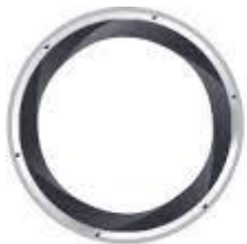
Large Aperture f/2